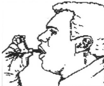
Recommended Use of Inhaler away from open mouth